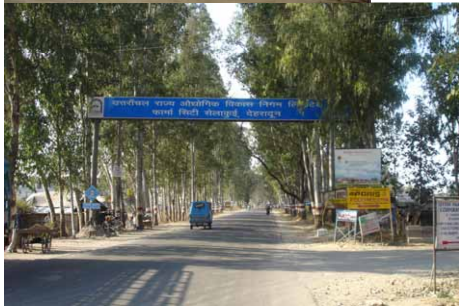
Direction board of Pharma City, Sela Qui, at Dehradun's Chakrata Road.