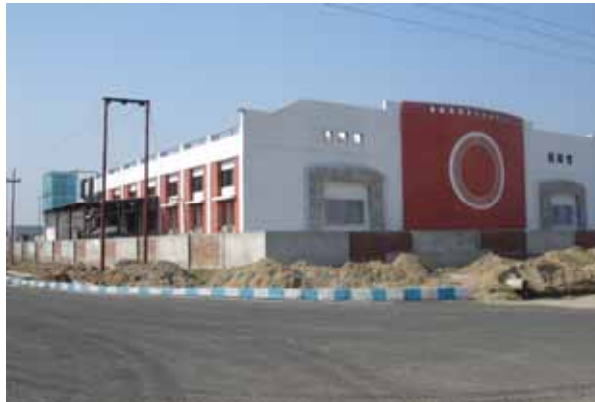
Construction work in completion stage in IIE Haridwar.

We are focusing on support 'Growth Pillars' such as roads, civil aviation, transportation, urban development and rural up-gradation.