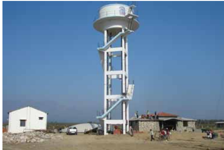
Construction of Pump House of Overhead Water tank, in Pharma City, Sela Qui, Dehradun.

Investment of the order of Rs.100,000 crore over the next 3 years with an employment potential of over 5 lakh is expected from the new SEZs apart from indirect employment during the construction period of the SEZs.